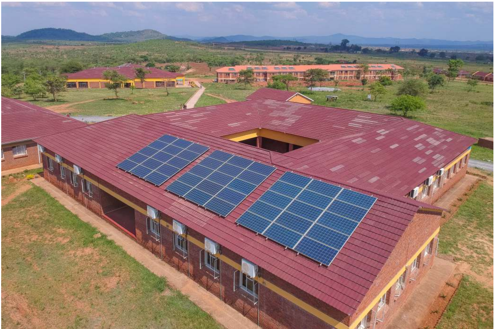
ZEGU ROOF TOPS - Drone shot showing some of the Solar Powered Institution facilities

Universities, as centres for research, are widely expected to lead the revolution from fossil fuels to clean sources of energy, as the nation and globe at large seek to reduce global warming.