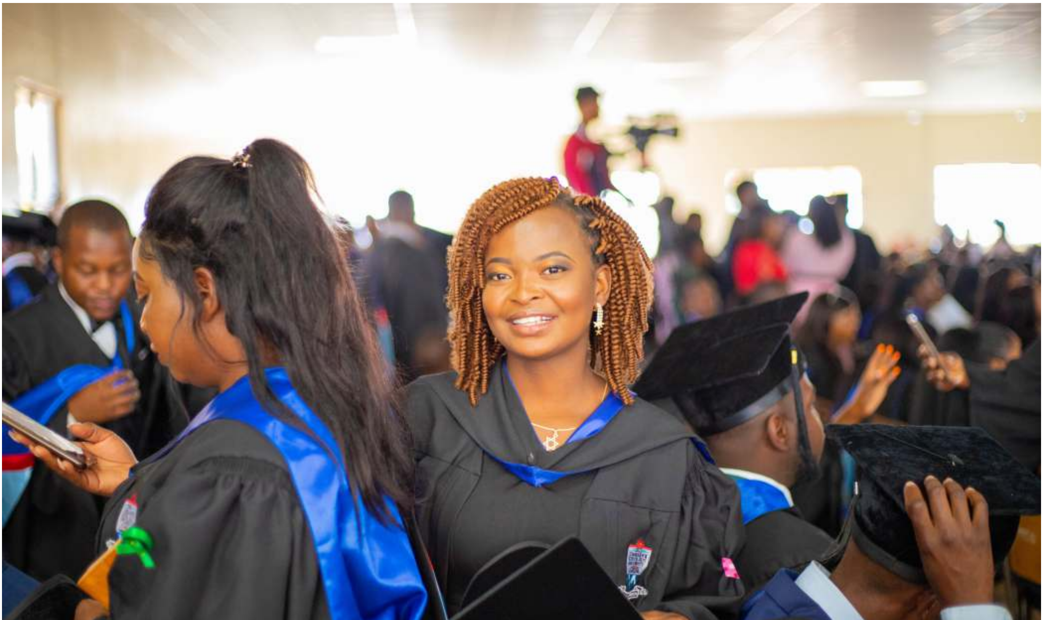
ZEGU GRADUATION CEREMONY - A cut away within the ceremony ( BELOW )

Recently, nine (9) programmes were accredited to the University by the Zimbabwe Chamber of Higher Education (ZIMCHE).