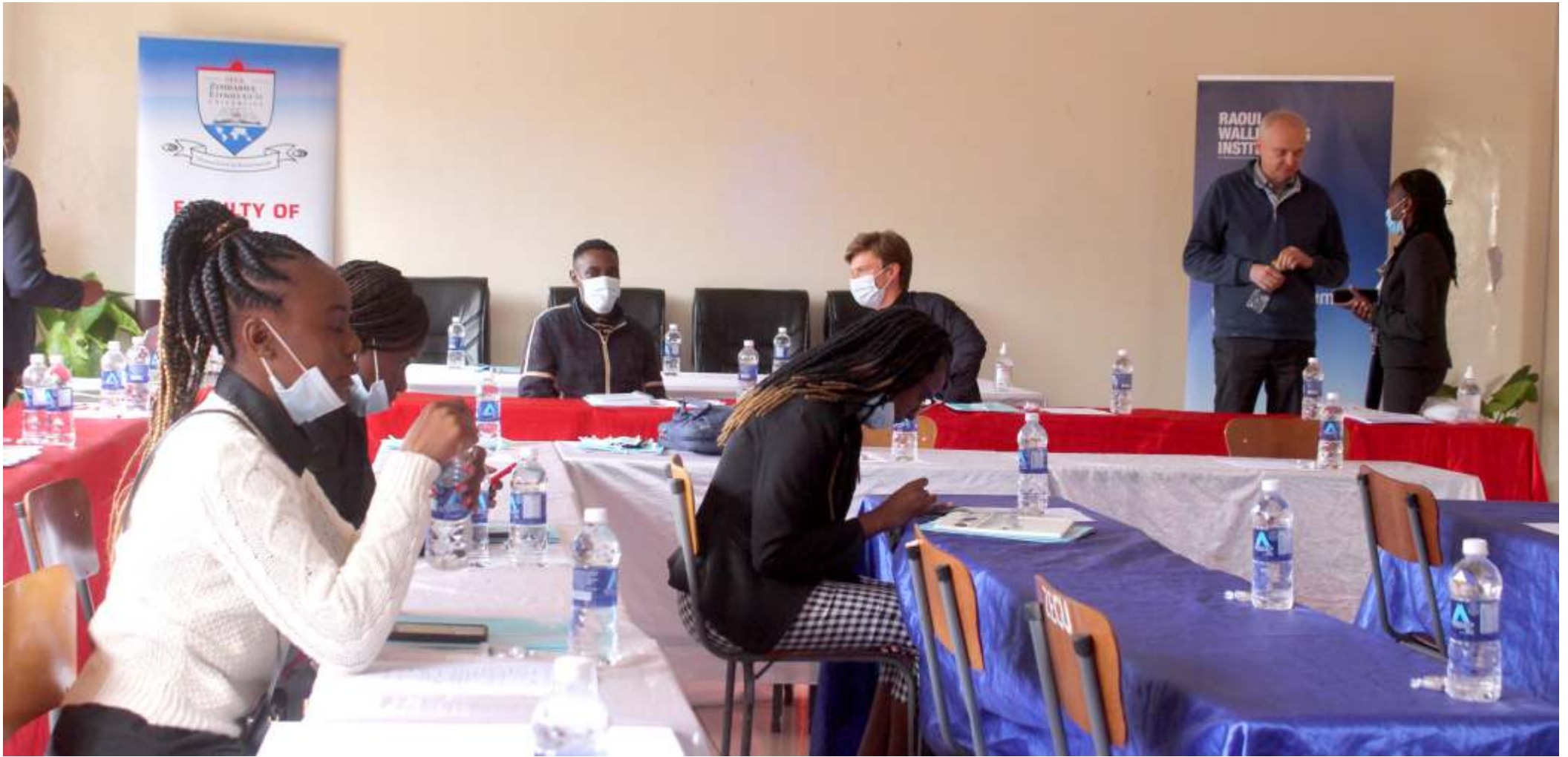
students from various institutions in RAUL Winter Law School class

Students follow proceedings at RAUL Winter School