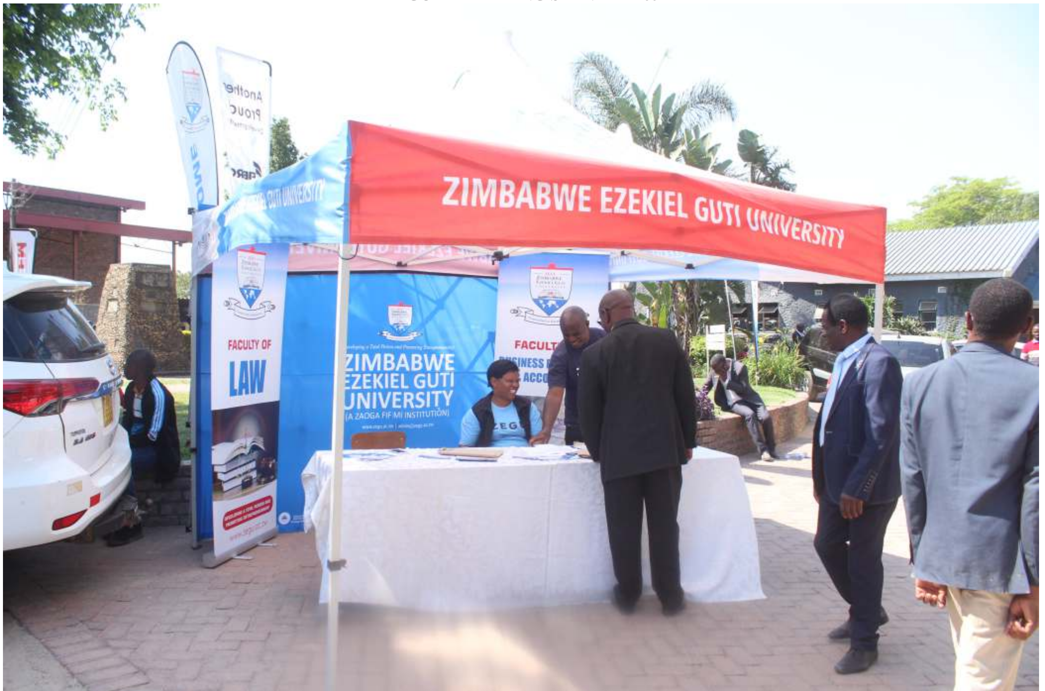
ZEGU MARKETING STAND Amfcc

The Wise Man Conference ran under the theme: “Moulding Today's Man for Excellence”.