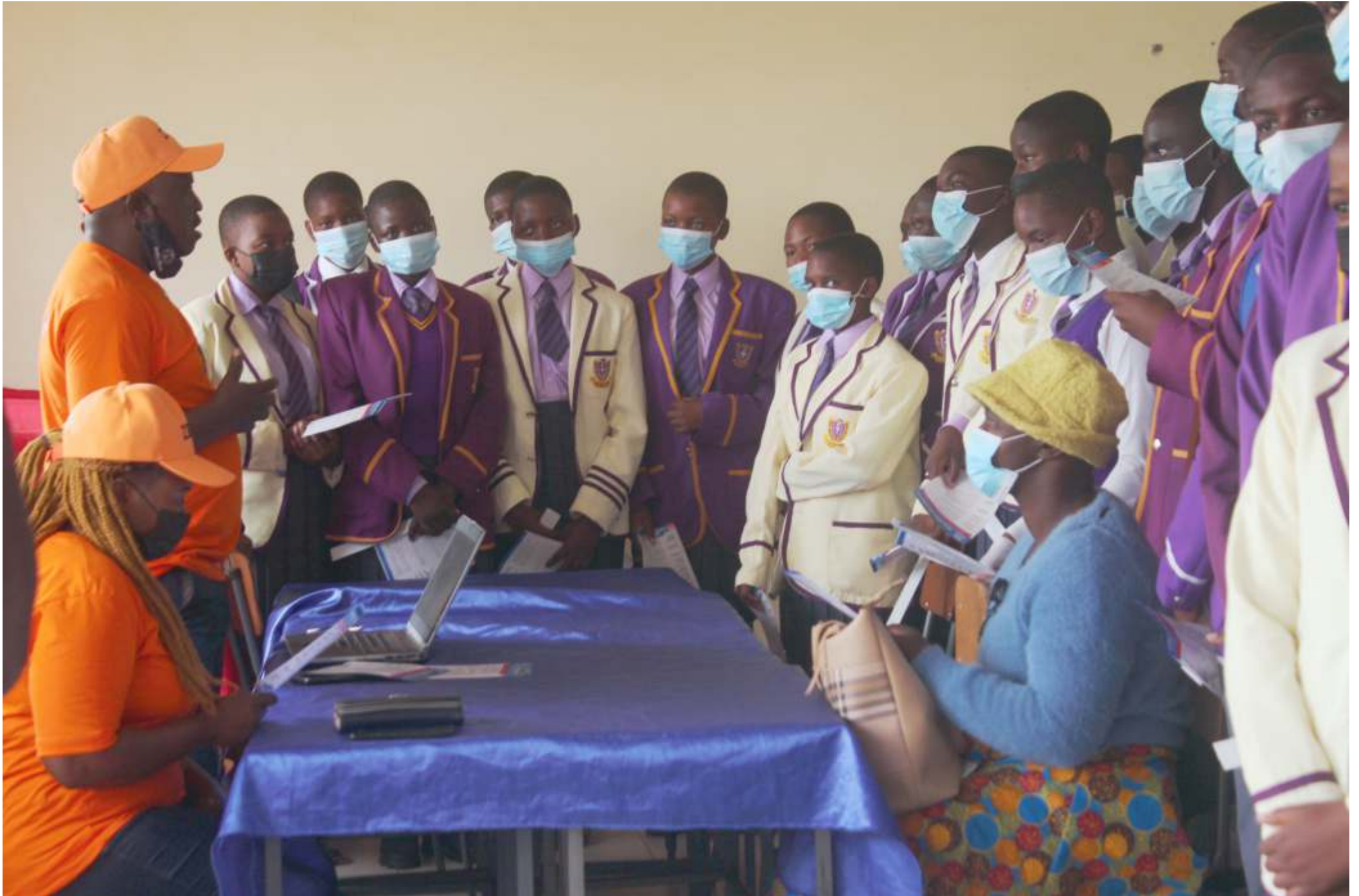
PUPILS following through the ZEGU station enquiries