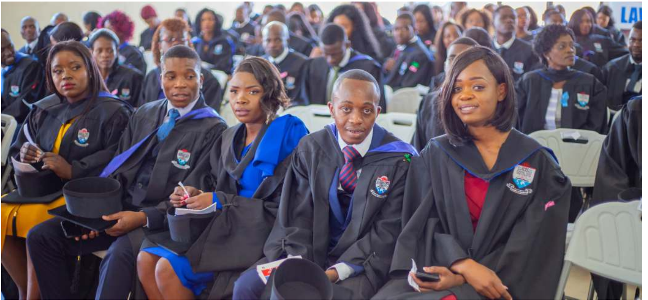
ZEGU GRADUATION CEREMONY - A cut away within the ceremony

THE Zimbabwe Ezekiel Guti University (ZEGU) is basking in glory as growth prospects continue to exceed expectations after 400 Graduands were capped by the Chancellor, Professor Ezekiel Guti, signifying a 57.7 percent (%) increase compared to the prior graduation where 230 students graduated.