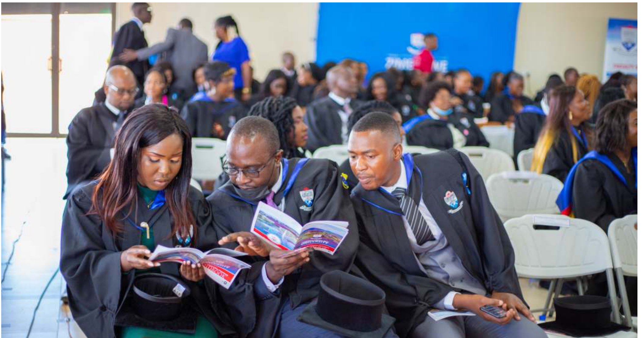
ZEGU GRADUANDS Going through the 6th Ceremony HandBook